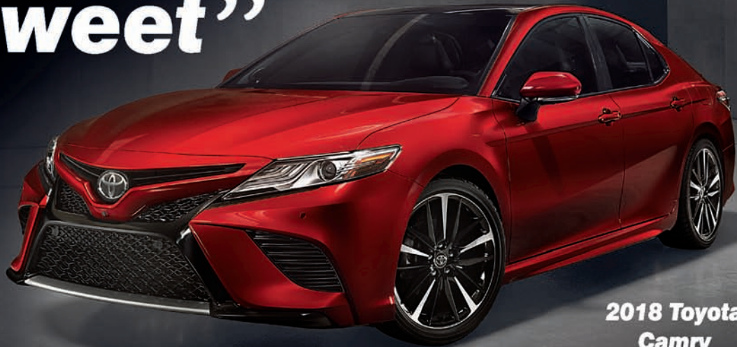
2018 Toyota Camry

The expressions may have changed in the last 50 years, but the beautiful styling, dependable engines and exhilarating performance continues to this day in the newly redesigned Toyota CAMRY. Test drive one today, and see what expression you'll come up with!